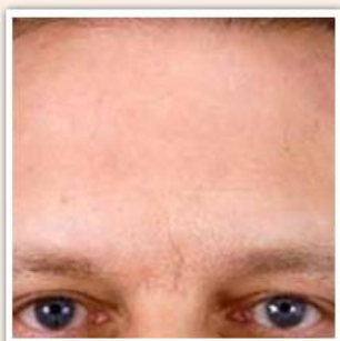
after 4 weeks