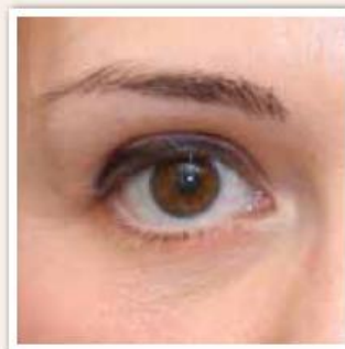
after 8 weeks