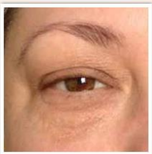
after 12 weeks