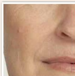
after 8 weeks