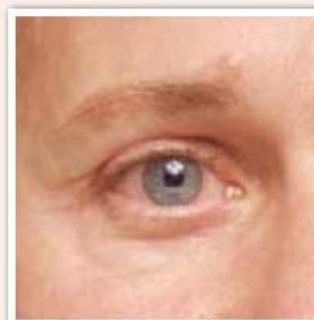
after 8 weeks