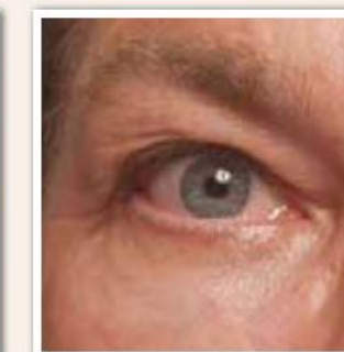
after 8 weeks